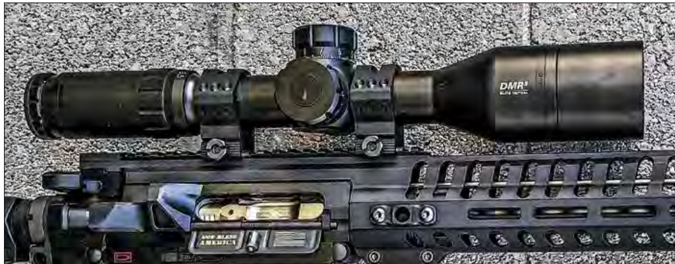
The flattop upper makes it easy to add optics like this Bushnell 3.5-21x50mm Elite Tactical DMR II, which the author used to easily tag targets at distance.