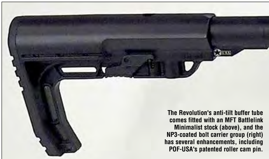
The Revolution's anti-tilt buffer tube comes fitted with an MFT Battlelink Minimalist stock (above), and the NP3-coated bolt carrier group (right) has several enhancements, including POF-USA's patented roller cam pin.

chamber and throat area of the barrel where expanding gas temperatures peak. Take into account the radiation properties of aluminum compared to traditional steel and you have 17 times more heat dissipation than a standard AR.