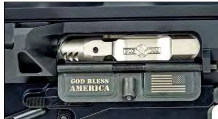
The upper (left) uses a 5.56mm NATO bolt carrier and POF-USA's E 2 extraction system while the Gen 4 lower (right) has fully ambidextrous controls.

of all of this effort is a comfortable, lightweight rifle that packs a much more powerful punch for serious threats.