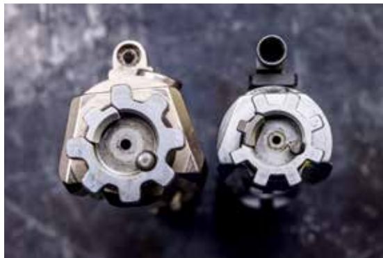
The P308 Edge bolt face is bigger than a .223 Remington bolt face to accommodate the larger case head size of the .308 Win.

Innovate and Test I can think of no other AR manufacturer that steps outside of the Mil-Spec design bubble the way POF does. As much as I like the AR-pattern rifle, it was designed in the late 1950s, and not much has changed since. The rifle has seen some incremental improvements, but few seem willing to take advan-