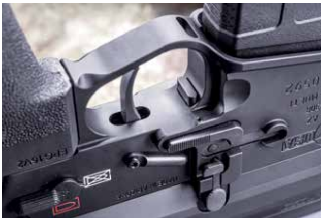
A unique, bilateral bolt catch is available for access inside the triggerguard, where it is both out of the way and easily engaged.