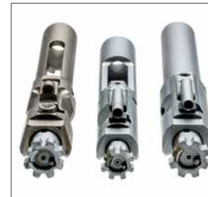
Left to right: The P308 Edge bolt carrier group (BCG), standard AR-15 BCG, standard AR-10 BCG. The P308 Edge is a piston carrier while the traditional AR-15 and AR-10 BCG are direct impingement.

Range Time I expected the P308 Edge to recoil more than the usual 7.62x51mm AR because it is a piston-operated rifle. Piston-operated guns typically recoil more sharply than their direct impingement (DI) counterparts. I was pleasantly surprised. The rifle feels lighter on recoil than it should be because POF put a mid-length gas system on their 16½-inch barrel. The advantage of using the mid-length gas system is the delayed pressure inside the bore when the piston pressurizes to operate the bolt carrier. The lower pressure