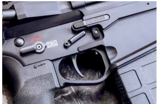
The Gen 4 lower receiver of the P308 Edge has an ambidextrous magazine release and anti-walk pins for the trigger.

Win. magazines are wider, the bolt face is bigger to fit around the case head, and the cartridge itself occupies more real estate than one for a rifle chambered in .223 Rem.