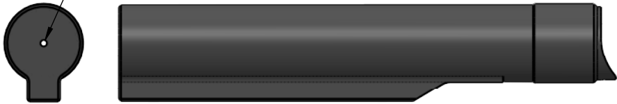
Standard 6 Position Mil-Spec Tube Approx 7.25" Long

2 Holes in back to purposefully identify = CMR/Revolution/Rogue tube