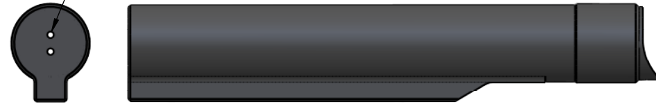
CMR/Revolution/Rogue 6 Position Mil-Spec Tube Approx 7.75" Long

2 Holes in back to purposefully identify = CMR/Revolution/Rogue tube