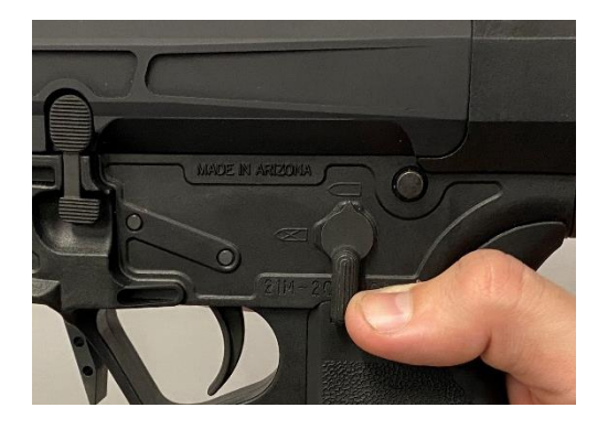
Figure 1 "SAFE"