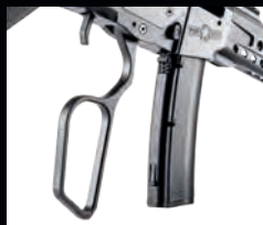
20RD STANDARD MAGAZINE