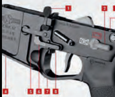
GEN 4 AMBI LOWER RECEIVER