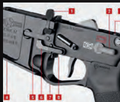
GEN 4 AMBI LOWER RECEIVER

We broke barriers and won awards when we released the piston driven .308 Revolution. By popular demand, The Revolution DI provides the same technology, same durability, same features, and same AR-15 size, but in a smaller direct impingement system featuring our 9-position adjustable Dictator gas block and Renegade rail. There is virtually nothing left to upgrade. The original Revolution weighed in at a paltry 7.35 pounds, turning heads for its incredible light weight and small stature for a .308. The Revolution DI weighs even less at 6.8 pounds with a 16" barrel, making it ideal for just about any situation you put it in.