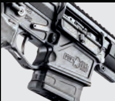
LIGHTWEIGHT ROGUE RECEIVER

THE ALL NEW PRESCOTT Project "Rogue" was an exercise to turn the Revolution platform into the lightest semi auto rifle on the market, and to do it without needless "lightening" cuts. Built on the Rogue platform, the Prescott makes hunting with a semi-auto reality. At 7 pounds, the Prescott is built for the great outdoors. The Prescott is available in both 6.5 Creedmoor and 6MM Creedmoor.