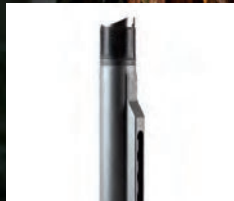
ANTI-TILT BUFFER TUBE