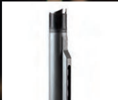
ANTI-TILT BUFFER TUBE