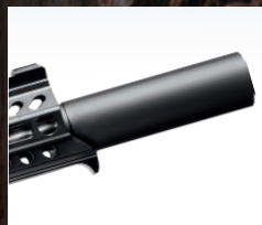
ENHANCED PRESSURE DEVICE