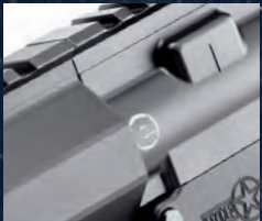
EXTRACTION UNDER ANY CONDITIONS