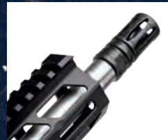
416R STAINLESS STEEL BARREL