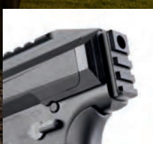
REAR 1913 RAIL + QD CUP