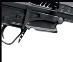
10/22 MAGAZINE COMPATIBLE