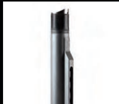
ANTI-TILT BUFFER TUBE