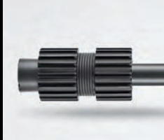
EDGE RAIL + HEAT SINK BARREL NUT