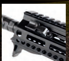
AMBI FOLDING CHARGING HANDLE

Born from the ashes and designed from the ground up. The all new PHOENIX subgun is the perfect plinking platform yet built for serious duty. It's an ideal host for your suppressed shooting and features a 1913 picatinny rail at the rear, making future conversions or adding a brace a breeze. The direct blowback system has proven to be extremely reliable around the world. The PHOENIX will ship with a proprietary 35 round magazine, magazine loader, two port muzzle brake, single point adjustable sling (pistol only) and hand stop.