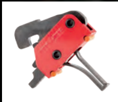
MATCH GRADE TRIGGER