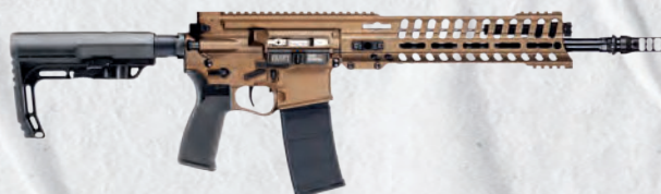
NEW 13.75 SERIES - BURNT BRONZE 5.56 NATO | 13.75 in Barrel | 36 IN OAL