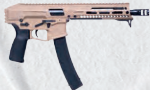
PISTOL 9mm | 8 in Barrel | 17.5 in OAL