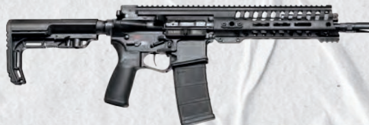
SBR - 5.56 NATO OR 300 BLK | PISTOL ALSO AVAILABLE 5.56 NATO / 300 BLK | 10.5 in Barrel | 28 IN OAL