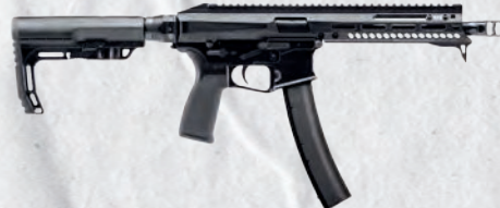
SBR 9mm | 8 in Barrel | 26 in OAL