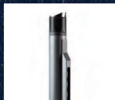
ANTI-TILT BUFFER TUBE