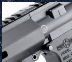
EXTRACTION UNDER ANY CONDITIONS