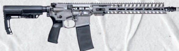
NEW 13.75 SERIES - 5.56 NATO OR .300 BLK 5.56 / .300 BLK | 13.75 in Barrel | 36 IN OAL