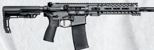
SBR - 5.56 NATO OR .350 LEGEND .350 / 5.56 | 10.5 in Barrel | 28 IN OAL