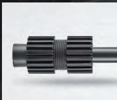
RENEGADE RAIL + HEAT SINK BARREL NUT