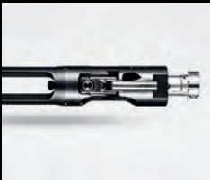
PATENTED ROLLER CAM PIN

The Minuteman has everything a respectable rifle needs and nothing it doesn't. Mount your favorite optic and the Minuteman is ready for the range or the field right out of the box. Go ahead and stack these features up to your favorite "other brand" carbine. We think you'll be impressed.