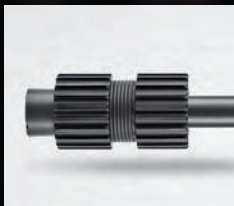
RENEGADE RAIL + HEAT SINK BARREL NUT