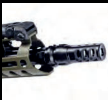
13.75" BARREL+ KEYMO MUZZLE BREAK