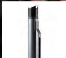
ANTI-TILT BUFFER TUBE