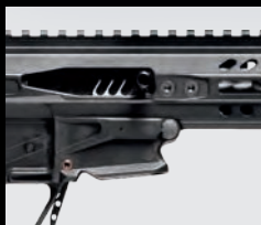
MONOLITHIC UPPER RECEIVER

Our love of shooting, training, and prepping future shooters were the driving factors of development. We had to bring a quality to this platform which hasn't been seen before. Aside from its light weight of just over 3lbs, the PSG 22 is equipped with a rear Q.D. mount for single point slings, Enhanced Pressure Device, and threaded barrel ready for your suppressor. The receiver accepts AR-15 pattern stock and brace options, and the trigger and selector are also compatible with AR-15 options. The PSG 22 features a monolithic upper receiver and injection molded lower receiver. To top it off, it accepts the widely available 10/22 ® magazine.