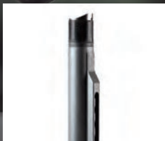
ANTI-TILT BUFFER TUBE