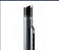
ANTI-TILT BUFFER TUBE