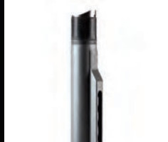
ANTI-TILT BUFFER TUBE