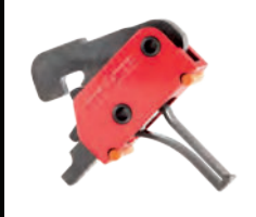
MATCH GRADE TRIGGER