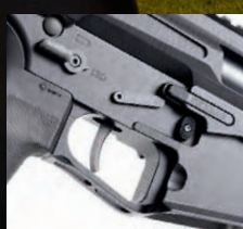
AMBIDEXTRIOUS LOWER RECEIVER