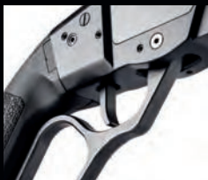
CRISP 3.5 LB TRIGGER

The Tombstone's compact overall length is just 36" and comes in at an ultra-lightweight 5.75lbs (unloaded weight). The proprietary trigger design features a smooth pull, and crisp break of 3.5lbs. The 16.5" free-floating 4150 steel barrel is complimented by POF's 10.5" Modular Receiver Rail (M.R.R.), with M-Lok slots at the 3, 6, 9, and a 2" picatinny rail at the 6 & 12 position. The integrated XS Ghost Ring sights allow for quick target acquisition and POF's removable dual port muzzle brake is ideal for fast follow-up shots.