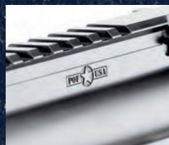
TRUE TO OUR CORE