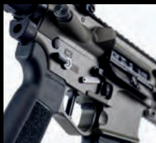
FULL FEATURE POF RECEIVER SET